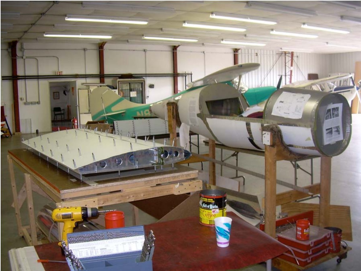
Left wing with skins clecoed in place. Champ and C140 stand guard over the other side of the hangar