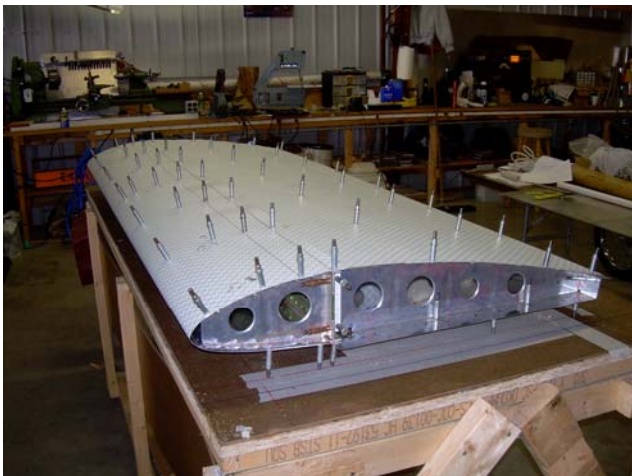
This is starting to look like an airplane wing