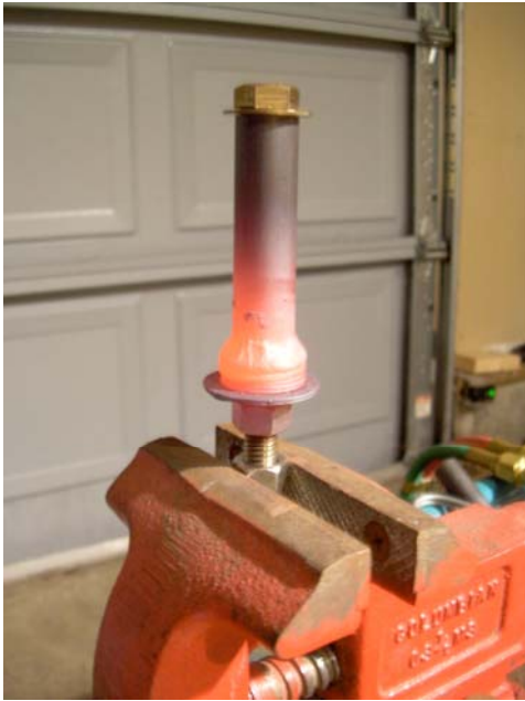
Landing gear bushing right after welding. My first welded part for the Hummelbird.